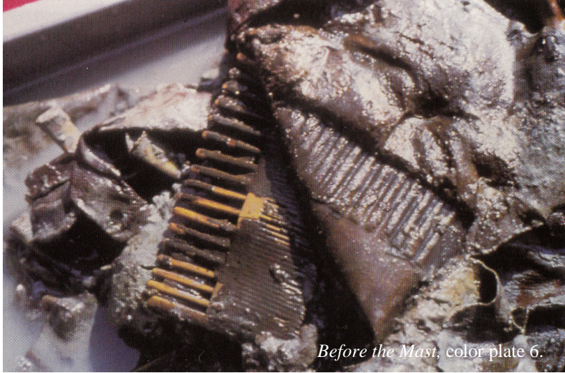
Before the Mast , color plate 6.