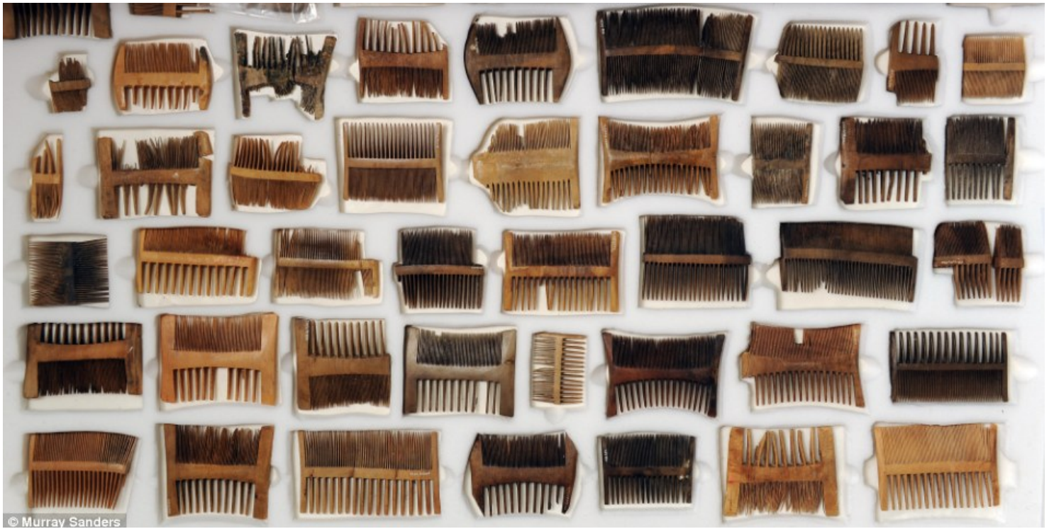
Lots of nit combs, Mary Rose website