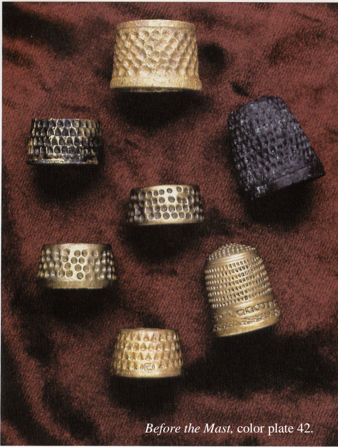
Before the Mast, color plate 42.

Most of the items in William's sewing kit were purchased or collected from various spots in my house. I like to sew and have a fair amount of sewing gadgets. I have two lovely period thimbles which were not chosen, due to the type of sewing which they would need to perform. Instead I have chosen a thimble with medium pits, a cap and a small rolled edge. I chose a thimble with a medium size because William's hands will not always be small. I have backed up my collection of sewing supplies with a minimum of research and pictures.