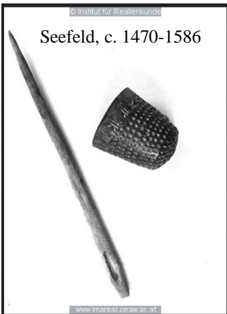
Seefeld, c. 1470-1586

I have included this picture because it shows yet another heavy duty thimble and a needle. Thimbles have not changed much through time.