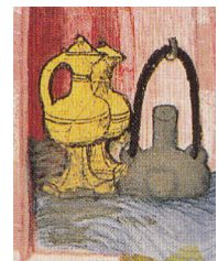
The Hunting Book of Gaston Phebus , p.47.